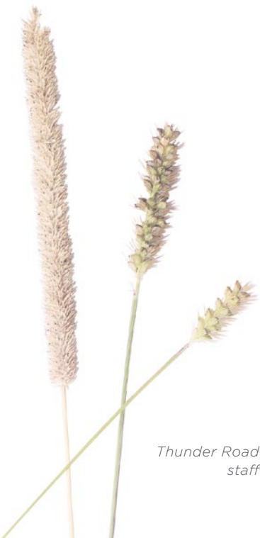
Thunder Road staff